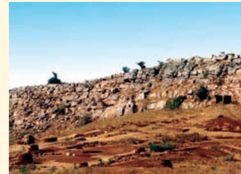
(Left) There are over 5,000 temples in this small town situated on the right bank of the river Yamuna; (above) Govardhan Parvat seems a span of open hilly ground

Govardhan. The Govardhan Parvat is near Vrindavan and about 25 km from Mathura. Govardhan Parvat is on a narrow sandstone hill near a large tank called Mansi Ganga. I expected to see a hill, but as I reached the cluster of shops and the temple, I realised that the