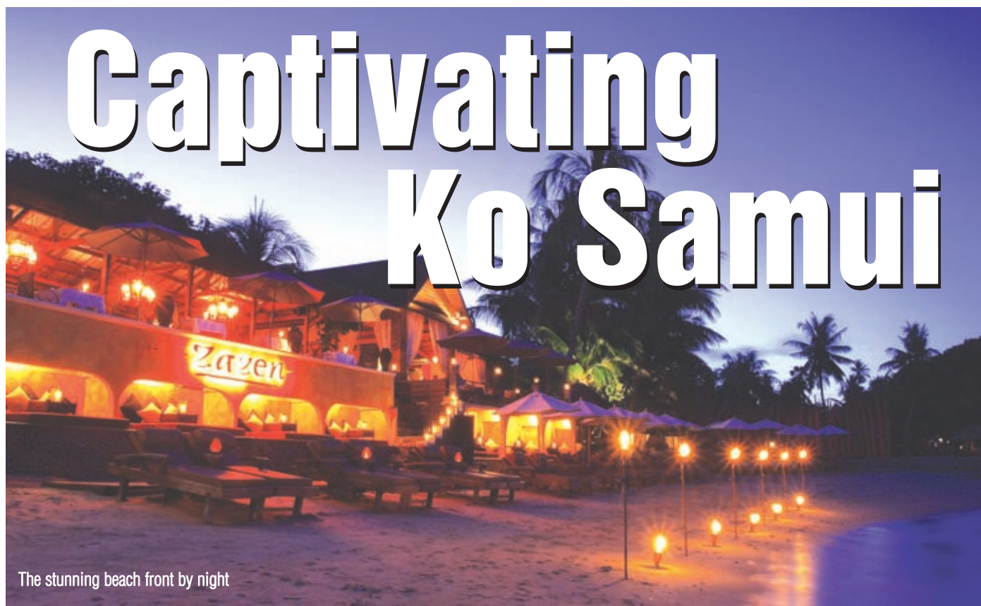
The stunning beach front by night

Also in March, the 125-room hotel is offering seven nights for the price of five. The special package includes continental breakfast, and kids under 12 eat free. The deal is available the entire month of March. To reserve, call (866) 570-7777 or visit www.sevenstarsgracebay.com .