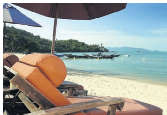
(Above) Sun beds on the beach; (right) Lemongrass king prawns with kaffir lime

The third stop was at a fishing village. Our guide explained that there were three groups that lived and worked there. The Muslims are the fishermen who fish at night and come back to land early in the morning to sell their fish. The Chinese are the merchants